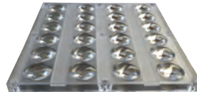
24 B 85 DM