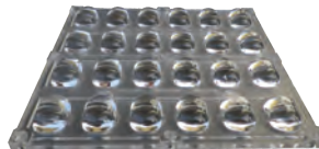
24 B ST 13060 A