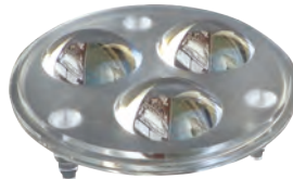
3 B 3570 D