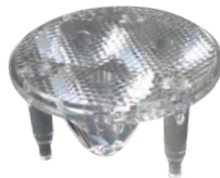
3 B 25 D