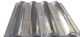
24 B MB